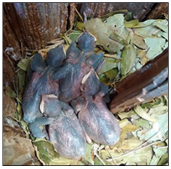
Piling cavity hatchlings.

• Takeaway: Western Purple Martins are not condominium-dwellers. They have accepted clusters of individual