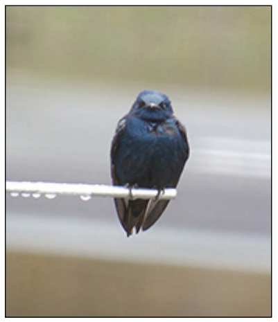
Fully adult male Purple Martin