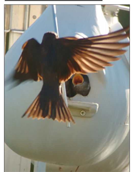
Female Purple Martin feeding babies

when no bugs were flying. The landlords added to their facilities with happy results. Many of neighbors, recognized here, contributed sailboat masts, etc., as perches during the season and that is important to the colony's success. I trimmed my bushes to see my dock better and rewarded with the sight of baby Purple Martins fledg-