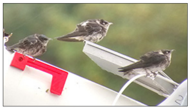
Fledglings in driving rain.

Seven adult birds including three fully adult blue/black males perch above the gourds and on the piling cavities from time to time. Baby birds begin peeking out of their nests, then struggling to get out. Early morning on August