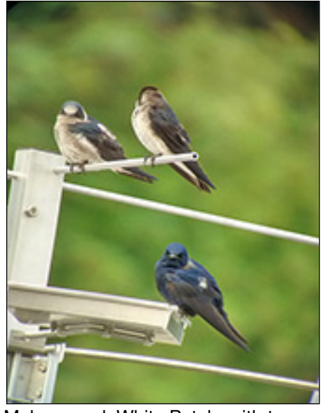
Male named, White Patch, with two females.

pilings are too close to land. Eventually sized the piling cavity opening small enough to prevent the starling while allowing Martins to enter. Gourd openings needed some shaving to accommodate Western Purple Martins (we have our subspeown cies) who are a tiny bit larger