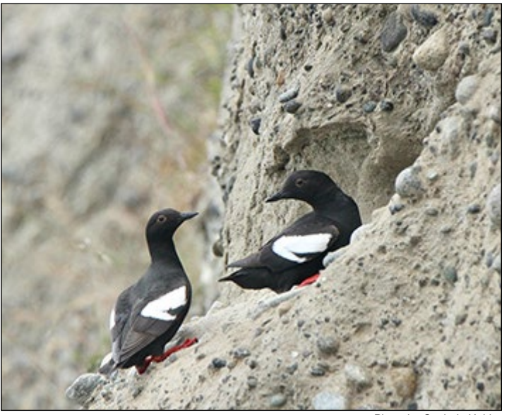
Pigeon Gillemot breeding pair on a bluff.

Wednesday, May 12 at 7 p.m. via Zoom — Training for beach volunteers. All new volunteers are expected to attend. Returning volunteers are welcome and encouraged to attend.