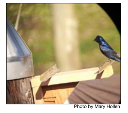
Purple Martin checking out Mary's nest boxes, closed to prevent House Sparrow nesting.