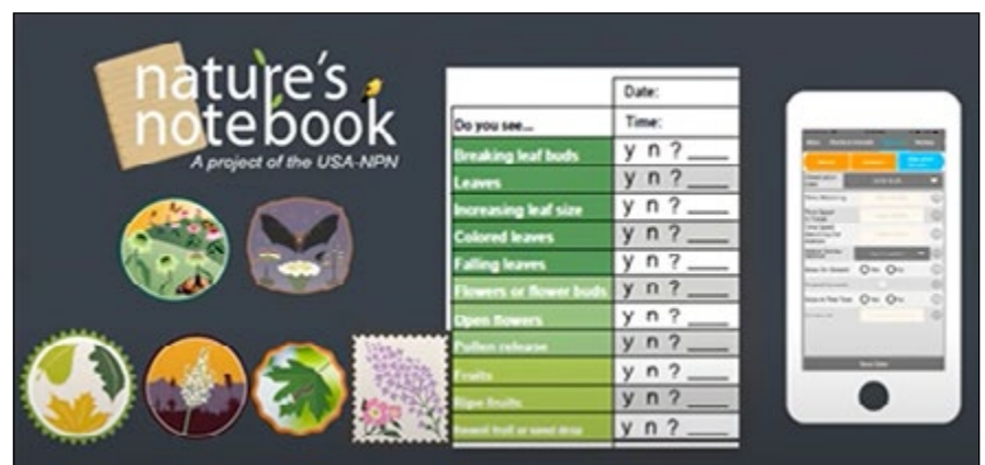
Phenology as a tool for understanding habitat change, October 6, 2020, www.youtube.com/watch?v=PpEkmZ9KM2c

The program begins at 7:30 after a brief meeting when we will vote for the Treasurer and Secretary positions on the was board. Also, come early to meet our latest scholarship recipients.