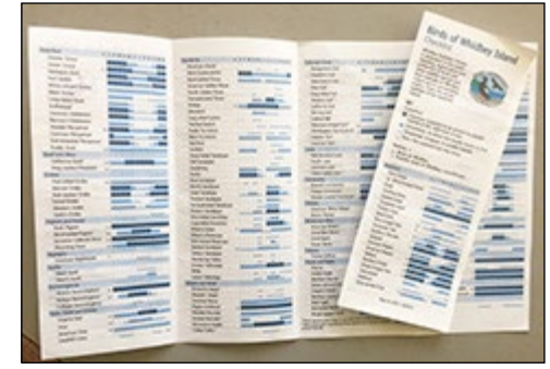
Look for the new Birds of Whidbey Checklist at local visitor centers, Wild Birds Unlimited stores and more. Or download it from the Whidbey Audubon Society website.

• Ensure you are positive of your identification of the species before proceeding.