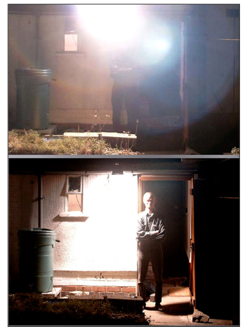
Fully shielded lighting is safer, more efficient, and costs no more than non-shielded lighting

Glare decreases safety because it shines into our eyes and constricts our pupils. This can not only be blinding, it also makes it more difficult for our eyes to adjust to low-light conditions. As the AMA says, "Glare from nighttime lighting can create hazards ranging from discomfort to frank visual disability." Anyone